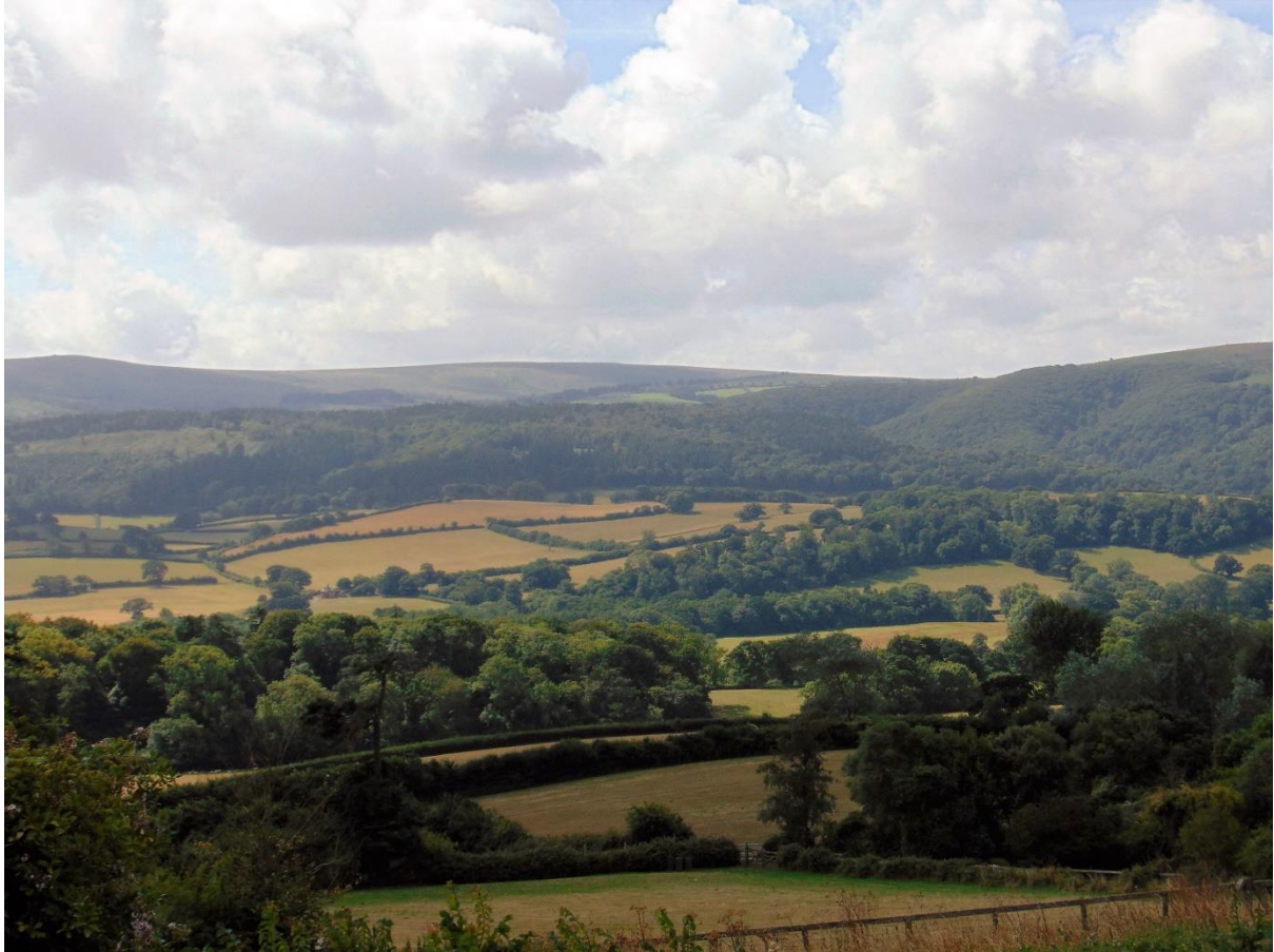
The view from Selworthy Church.

Wherever you stand on the Holnicote estate, you can experience the spirit of diversity that the place exudes. Although it is one estate, with historic boundaries, within its bounds are many habitats. There is, to quote the county of Rutland's motto, Multum in Parvo . It is partly defined by the awe inspiring views that stretch across the entire estate (on a clear day) and partly by a 'layered' identity based on the interaction between different elements. Holnicote sits across four ancient manors: Bossington, Holnicote, East Luccombe and Selworthy, within an area of 20 square miles, constituting 5,026 hectares (12,420 acres), on the northernmost edge of Exmoor National Park. The landscape ranges from moorland to coast and supports vibrant human and non-human communities. The built estate includes 170 houses and cottages, which ranges from medieval buildings to 20 th century cottages and farmhouses. Sixty of these buildings retain their combed wheat thatch, the traditional material used for roofing in Exmoor. The land is mostly rented to tenant farmers, many of whom come from families who have worked the same land for generations.