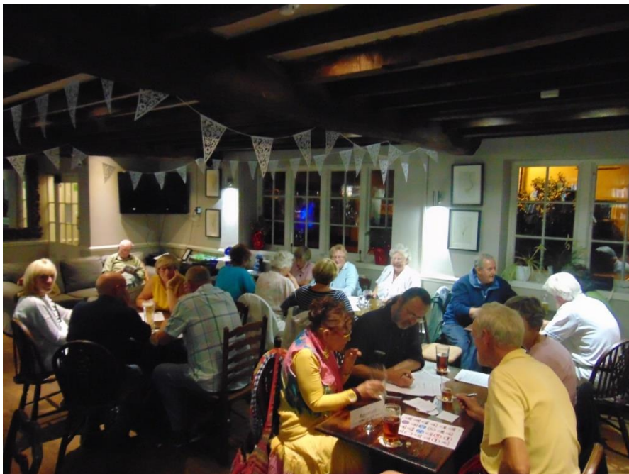
Local people and visitors taking part in the themed project pub quiz at The Castle, Porlock. 31 st August 2016.