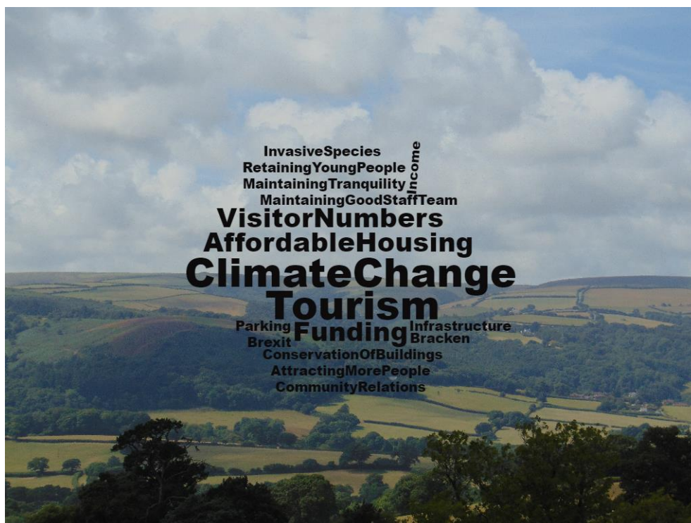
Above: Challenges that were suggested from our surveys and interviews.

Our survey built upon these existing challenges but also identified a new one. Pressure of tourism featured strongly. However, by far the most significant, in terms of the number of people who considered it, is climate change and the probably yet unknown effects it will have on the estate itself. Sustainable funding for the future of the estate was yet another issue. Some local people also believe that the National Trust should be there to support local people first in terms of housing and therefore limit increases in rental rates.