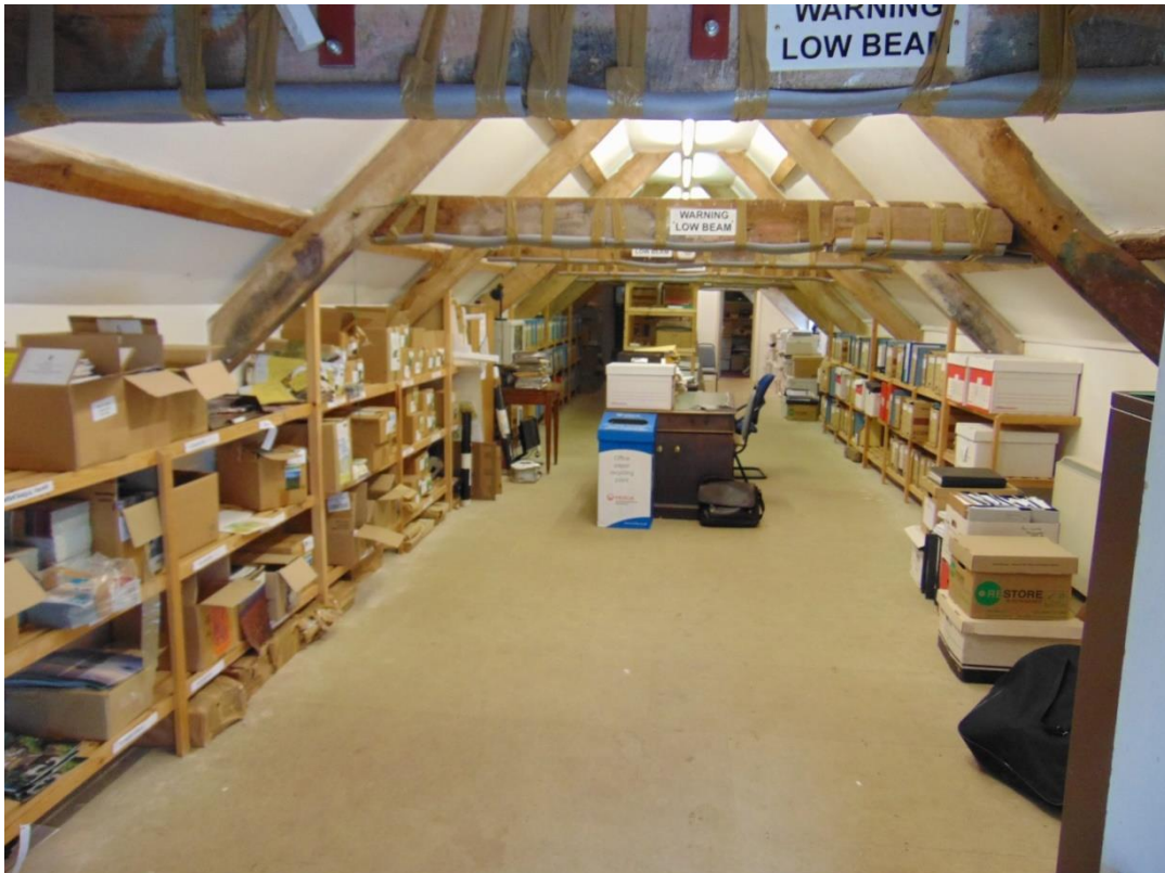
Holnicote Estate Archive. Credit: Ben Eagle

Our methods involved a mix of practices from historical studies and social science: archival research; surveys and informal discussions with visitors, locals and Trust volunteers; semi-structured interviews with Trust staff; and, not least, innovative community-based methods of engagement such as a themed pub quiz run in partnership with a local business.