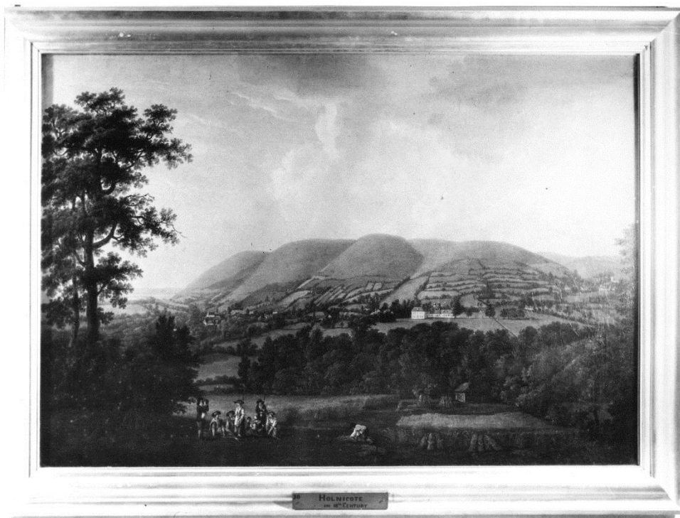
Eighteenth-century oil painting of the view from Luccombe to North Hill. Artist unknown.

Change in tree cover is particularly significant and visually apparent. The 10 th Baronet, Sir Thomas Acland, known as ‘the great Sir Thomas’, planted thousands of trees on the southern side of North Hill, principally between 1810 and 1826. 23,000 were planted at Selworthy Plantation, 26,000 at Tivington and 25,000 at Holnicote (Ridler, 1983). Venn Plantation was added as an outlier to the existing Great Wood. This visionary act significantly impacted upon the landscape but, we argue, did not negatively impact upon the spirit of place of the estate as a whole for it kept the essence of place in mind. These changes are highlighted when comparing a mid-eighteenth century print (artist unknown) with Roger Miles’s photograph of the same view in 1961.