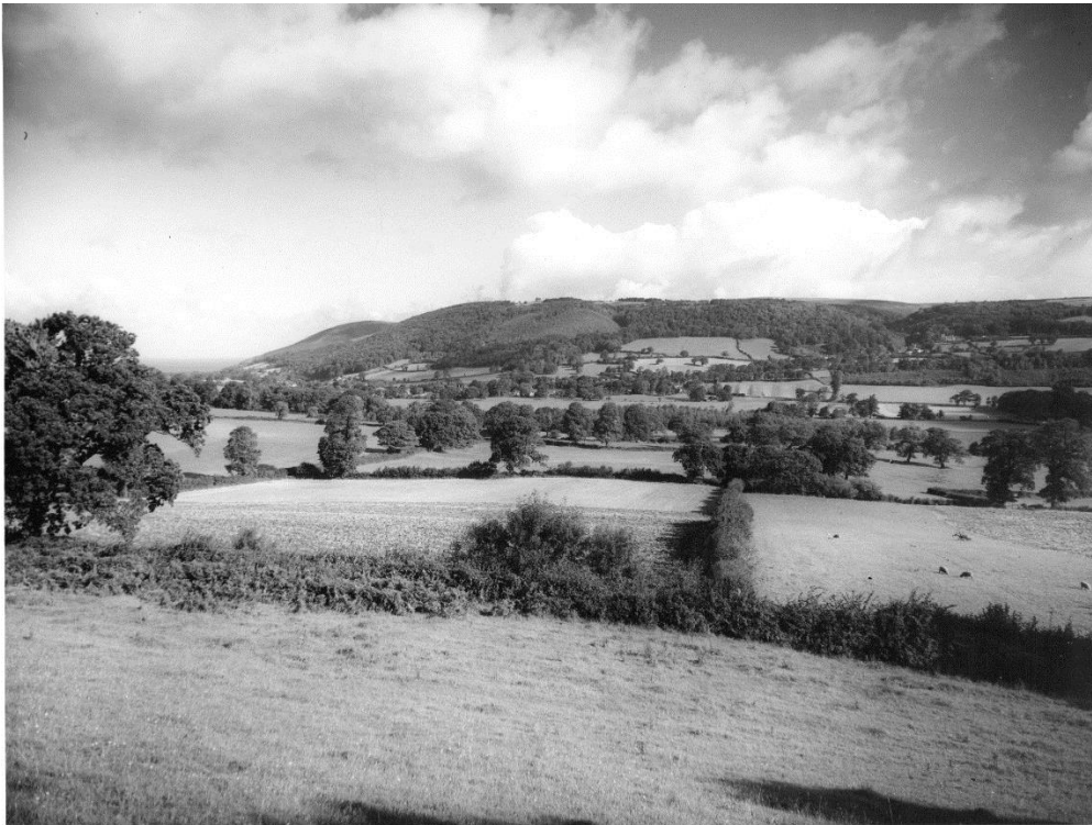
View towards Selworthy.