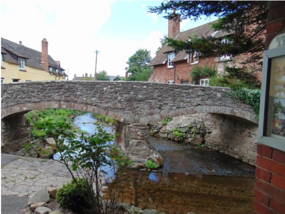
Packhorse bridge in Allerford.

annual dinner for the farmers organised by National Trust staff which helps maintain the bond between those who work on the estate. A wide range of local events, such as flower shows, fetes, barn dances and talks, illustrate (and foster) the close nature of the community. Tourism and farming are the two pillars of the local economy, and the estate itself is a magnet for attracting visitors.