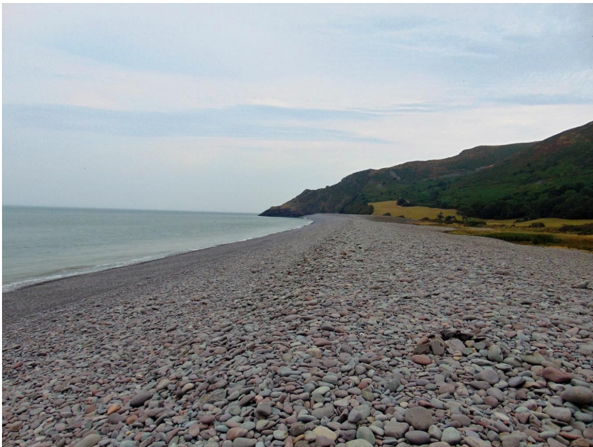
Bossington beach: Credit Ben Eagle.

The estate is a patchwork of small fields and copses, picturesque hamlets and villages, sizable woodland in the form of Horner Wood (part of Dunkery and Horner Wood National Nature Reserve and windswept moorland, including the highest point on Exmoor, Dunkery Beacon [520 metres], overlooking the Bristol Channel to the north and, to the south, the remainder of Exmoor. There are over a hundred miles of footpaths on the estate and an active volunteer team who help the rangers to maintain these - as well as to assist with a wide variety of conservation tasks across the estate. Holnicote also possesses a wealth of prehistoric features, with Bronze Age cairns, barrows and hut circles and Iron Age hillforts dotting the landscape.