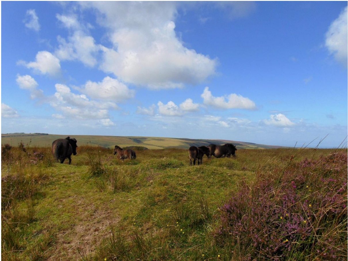
Exmoor Ponies.

A key challenge for the project was to identify a single, unified spirit of place amidst all of this glorious diversity.